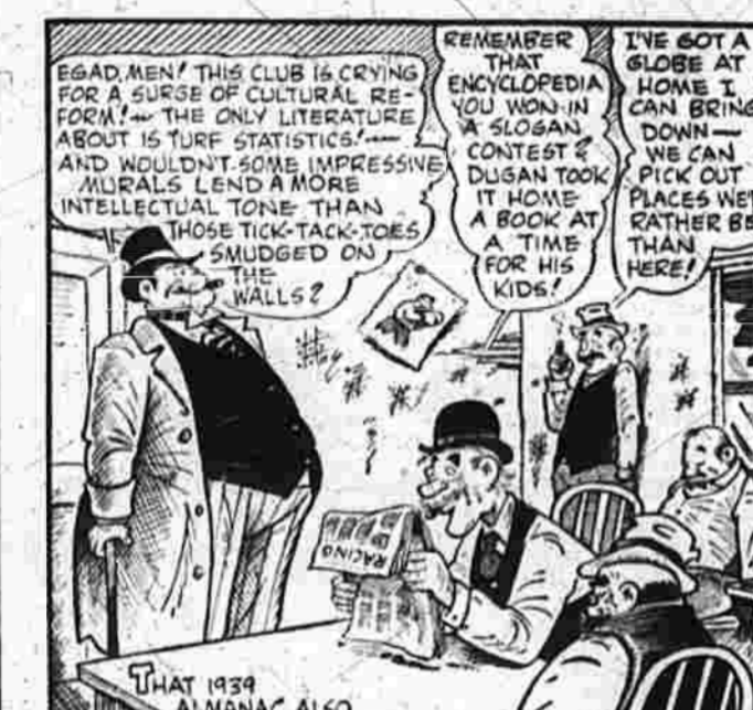
Take Off Boys! BY V. T. HAMLIN